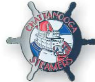
PROMOTIONAL DIE-STRUCK See Page 12