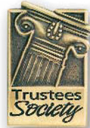
DIE-STRUCK ANTIQUE See Page 11