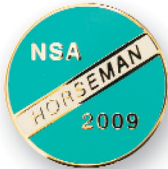
ULTRA CLOIS PROCESS See Page 8