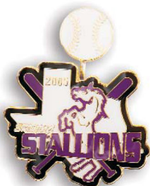
PROMO DIE-STRUCK See Page 12